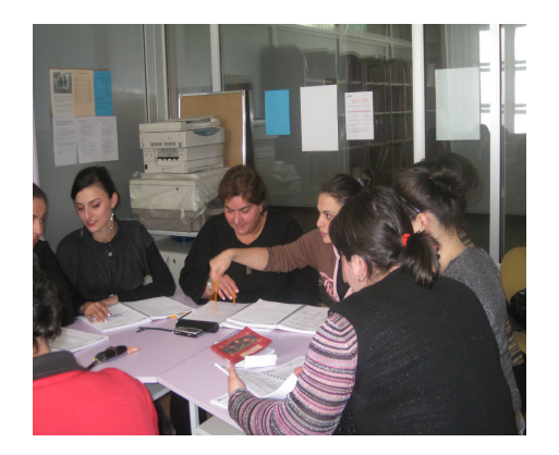
TKT Training, Tbilisi

We invite YOU as well as any other English Teacher, member or non-member, to participate in ETAG accredited training courses. Just a reminder that we offer the best training programmes, highly qualified trainers, international standards trainings, a British Council-ETAG joint certificate (in case of TKT) and most importantly, a true way to career development.